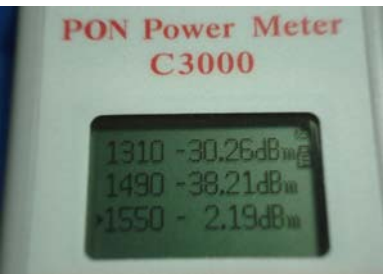
The "low" indicates power <-60dBm. The power readings at two adjacent channels are the small cross-talk from 1550nm.

To cancel auto-off function, press the Auto Off key. A power symbol without a cross is shown on the LCD.